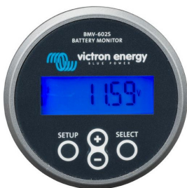
BMV 602S Black