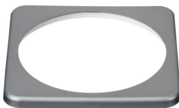
BMV bezel square