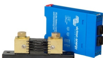
VE.Net Battery Controller

No prescaler needed. Note: RJ45 connectors are galvanically isolated from Controller and shunt.