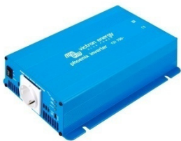
Phoenix Inverter 12/750 with Schuko socket