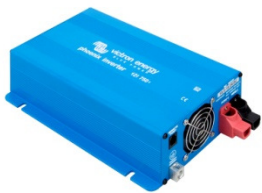
Phoenix Inverter 12/750