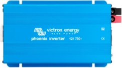
Phoenix Inverter 12/750